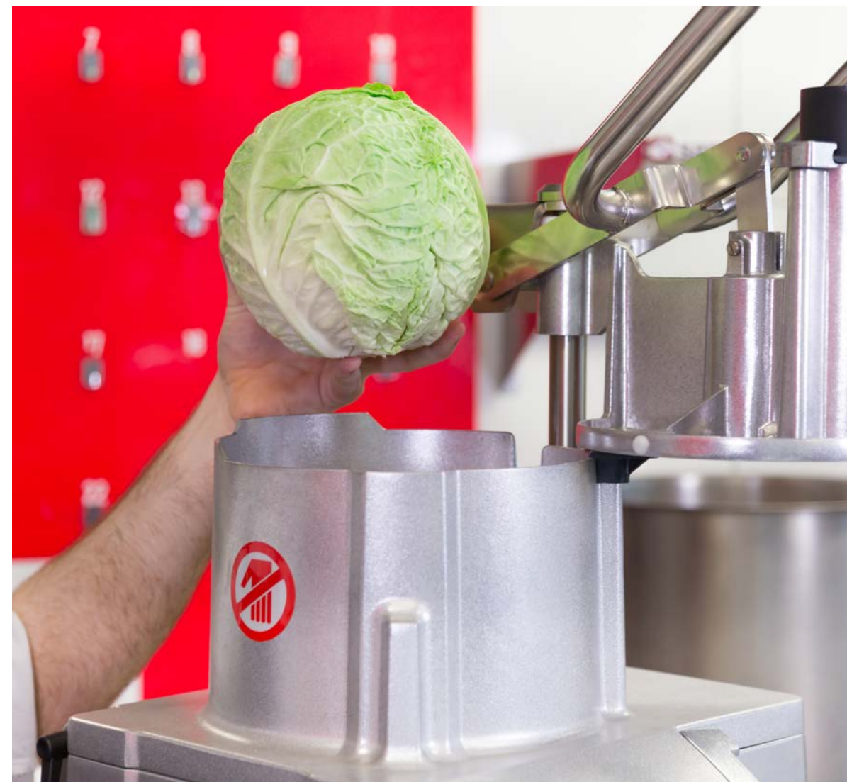
Large Capacity Attachment