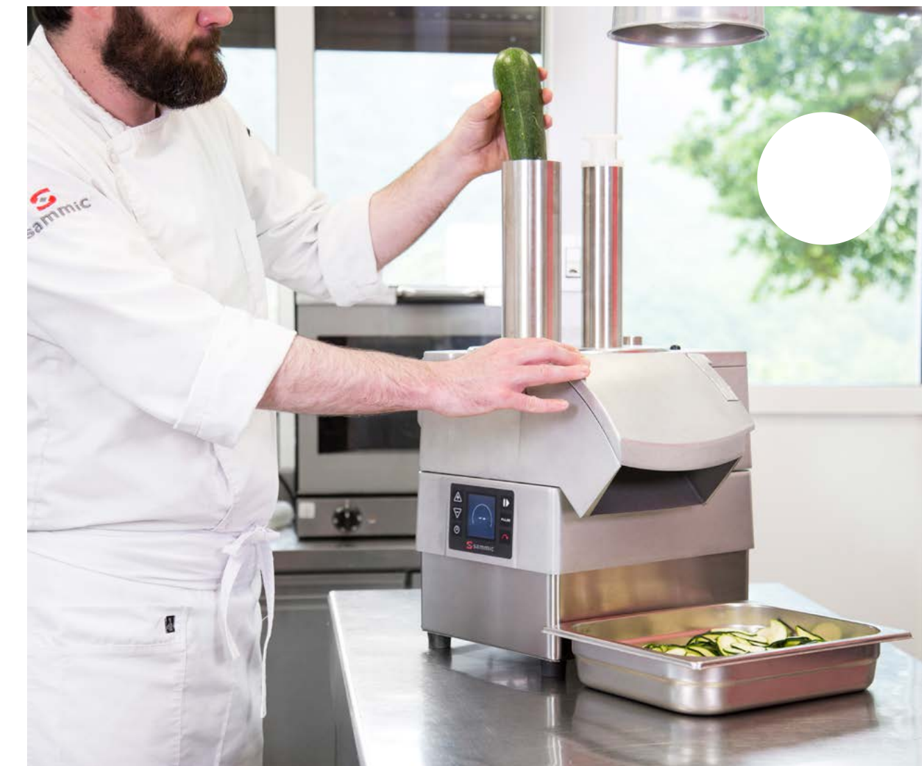
Long vegetable attachment